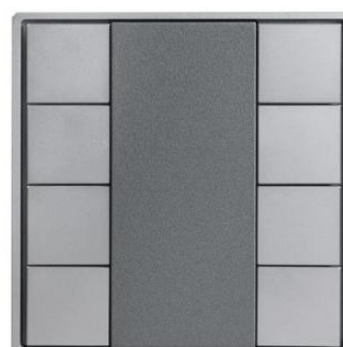
8 Fold Push button