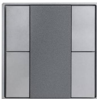
4 Fold Push button