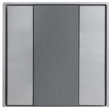
2 Fold Push button